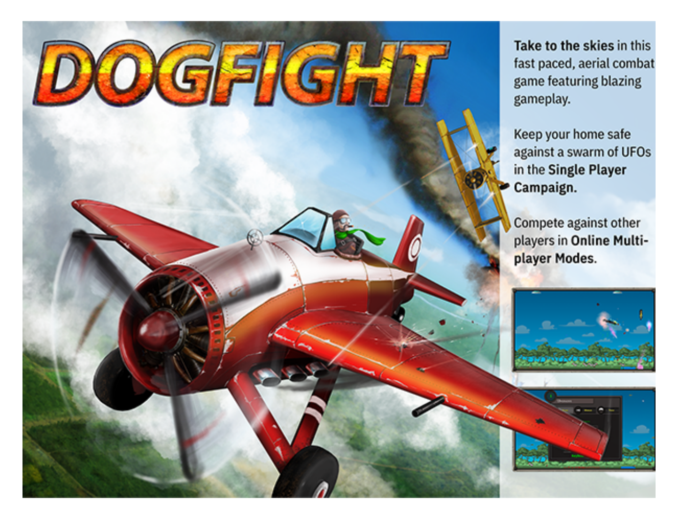
Compete with your friends to see who's the best pilot.