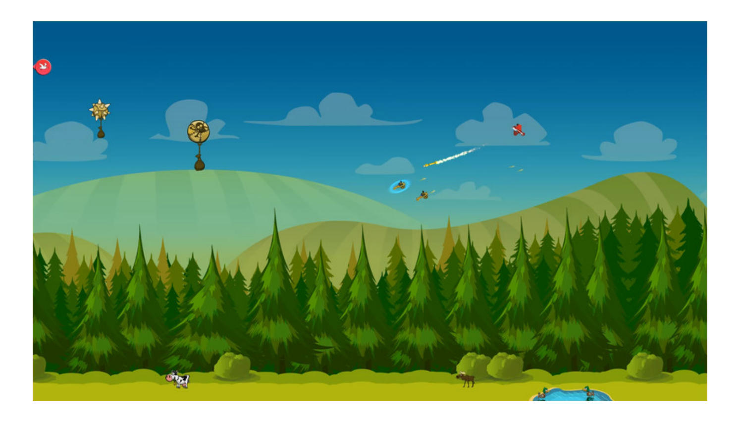
Dog Fight Super Ultra Deluxe Activation Code Offline

Download >>> <a href="http://bit.ly/2NHdAdF">http://bit.ly/2NHdAdF</a>